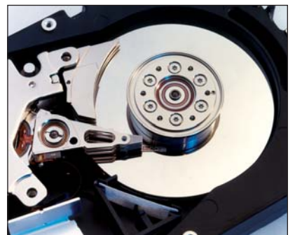
Fluid dynamic bearings