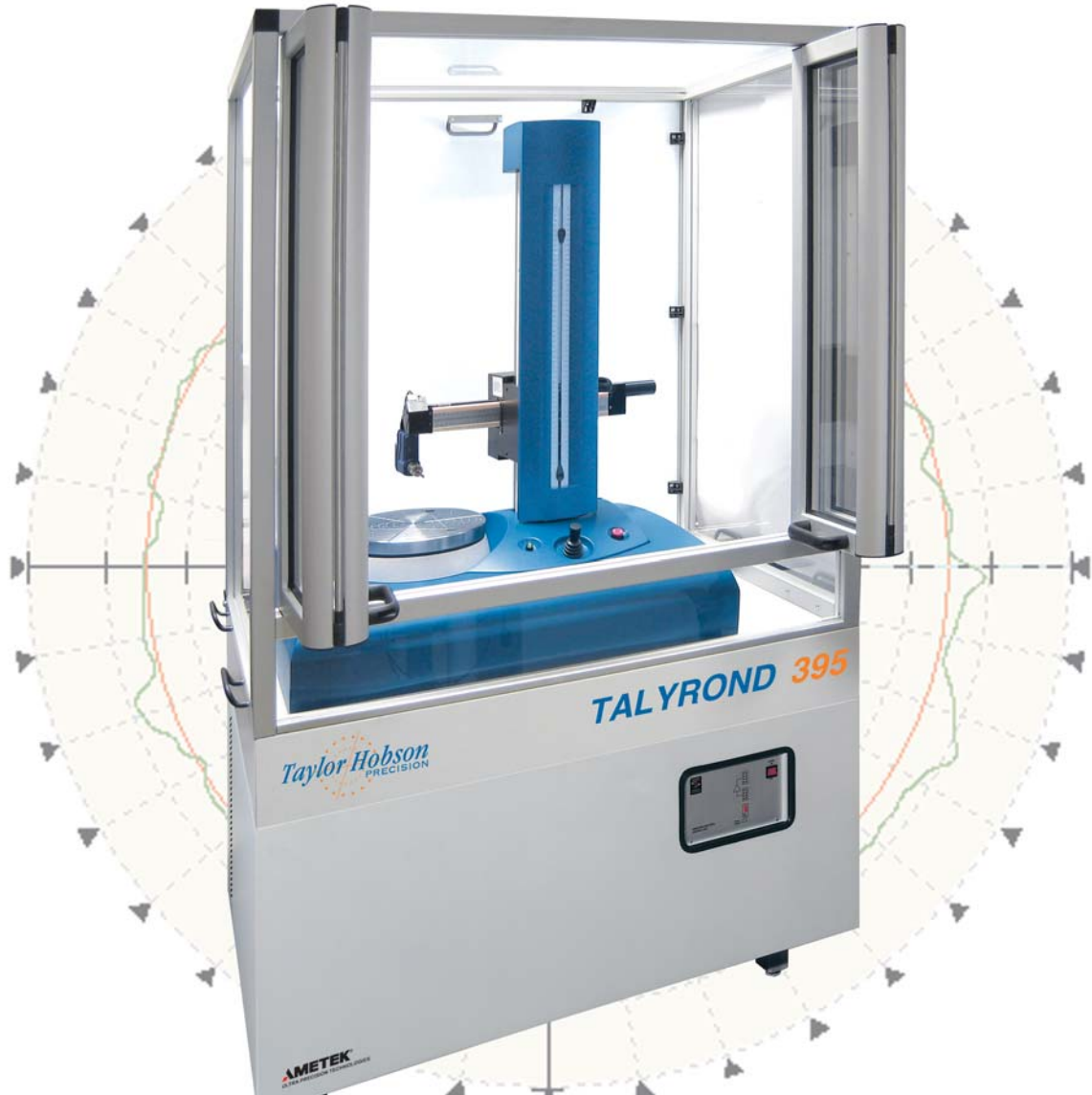
Talyrond 395 for the measurement of precision components

The Talyrond 395 has been designed specifically for the measurement of precision components. The instrument's construction, external isolation and full CNC operation provide the platform required for the most demanding of environments.